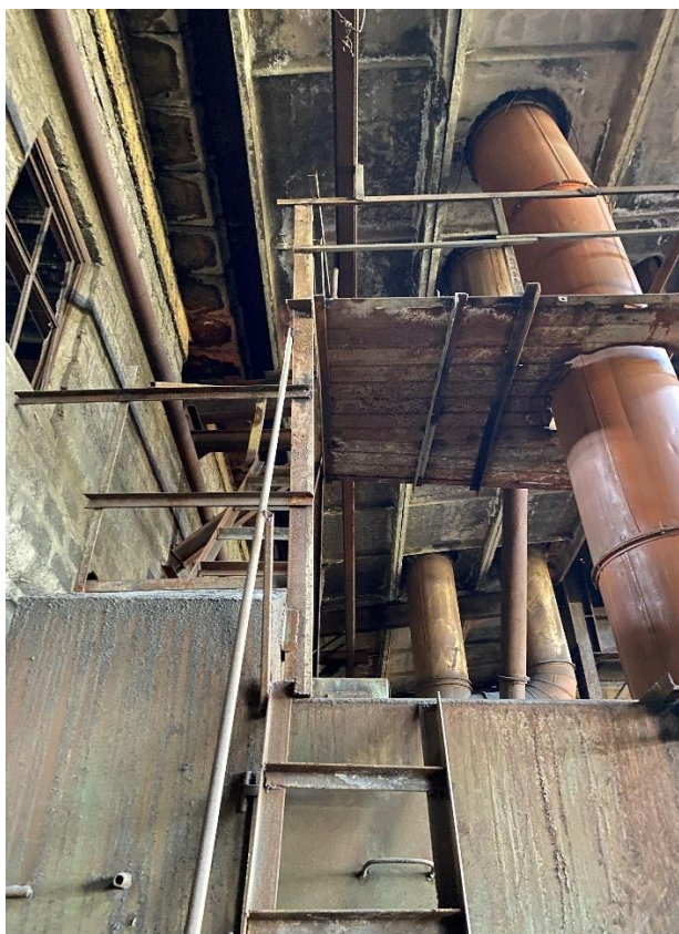
Stack left side with measuring platform

The customer or a third-party company commissioned by the customer shall carry out the installation of the nozzles in the stack. All necessary drilling and welding works will be executed by the customer.