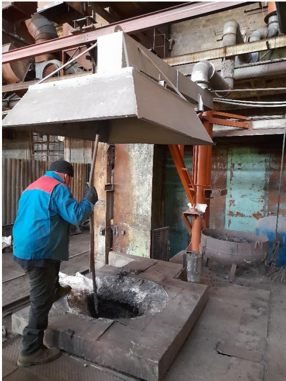
Collector above the furnace