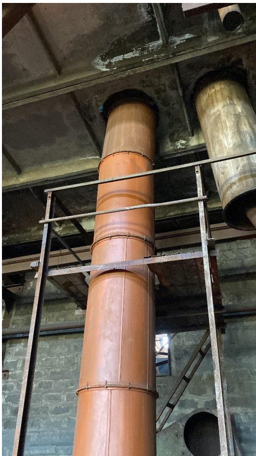
Stack leading through the ceiling