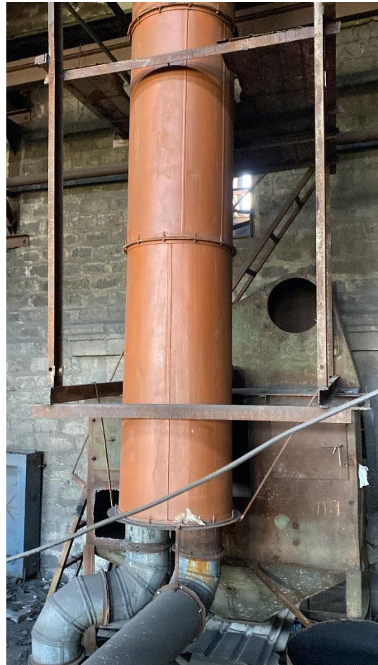
2 flue gas ducts merging in common stack