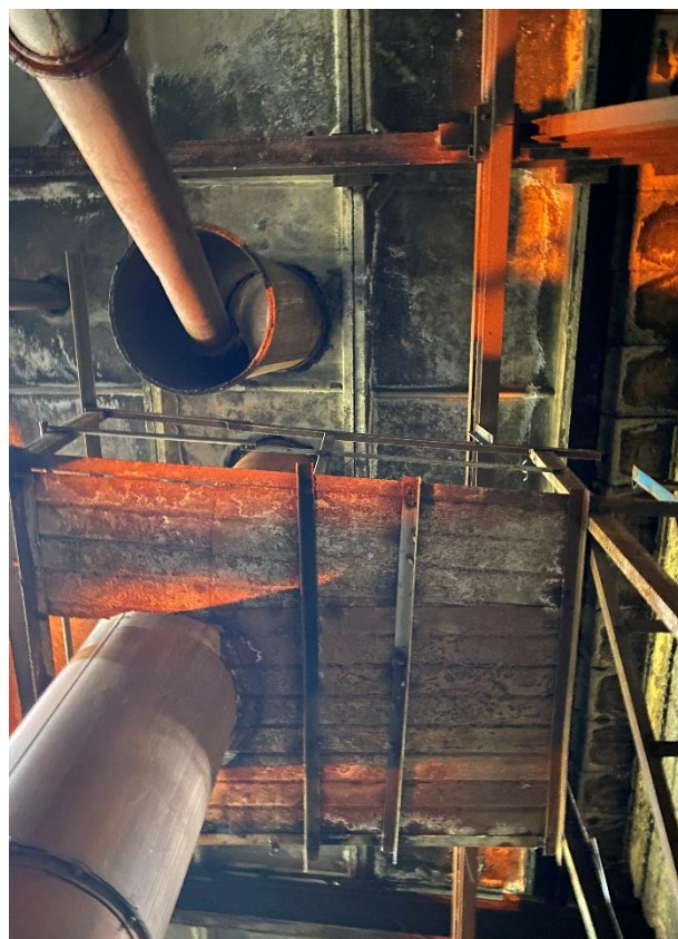
Measuring platform from below